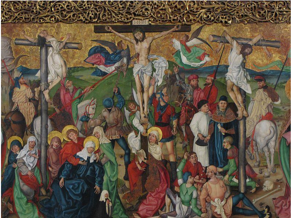
Crucifixion , from the Buhl Altarpiece, a particularly large Gothic oil on panel painting from the 1490s.

By © Ralph Hammann - Wikimedia Commons - Own work, CC BY-SA 4.0, https://commons.wikimedia.org/w/index.php?curid=40873132