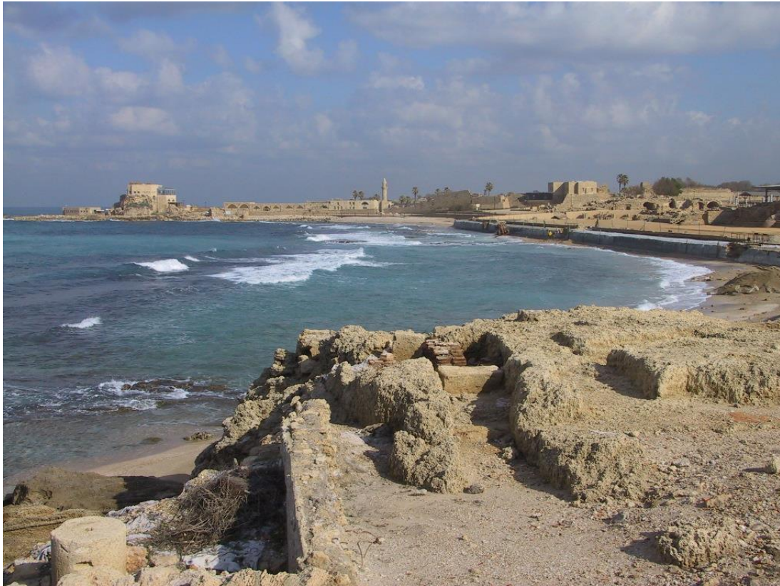
Ancient Caesarea