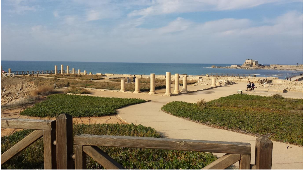
Herod's Praetorium, with peristyle courtyard. 2