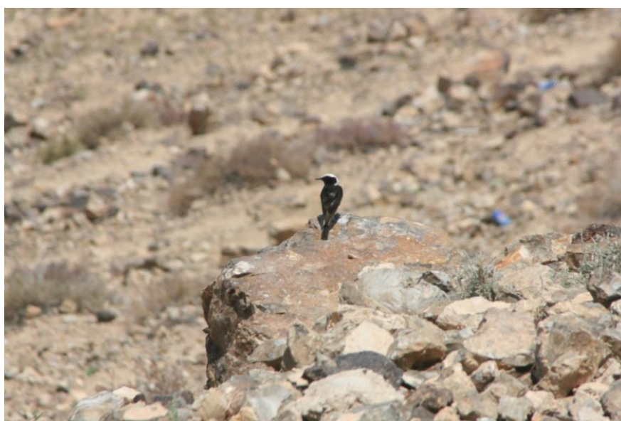
The Judean Wilderness.