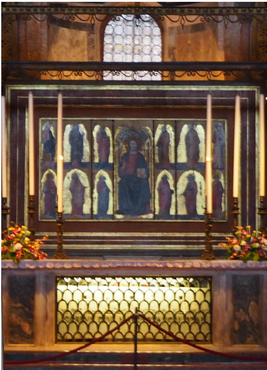
The tomb of St Mark the Evangelist at the high altar in the Cathedral St Mark, in Venice.

Jesus announces the “Gospel” from the “Wilderness”