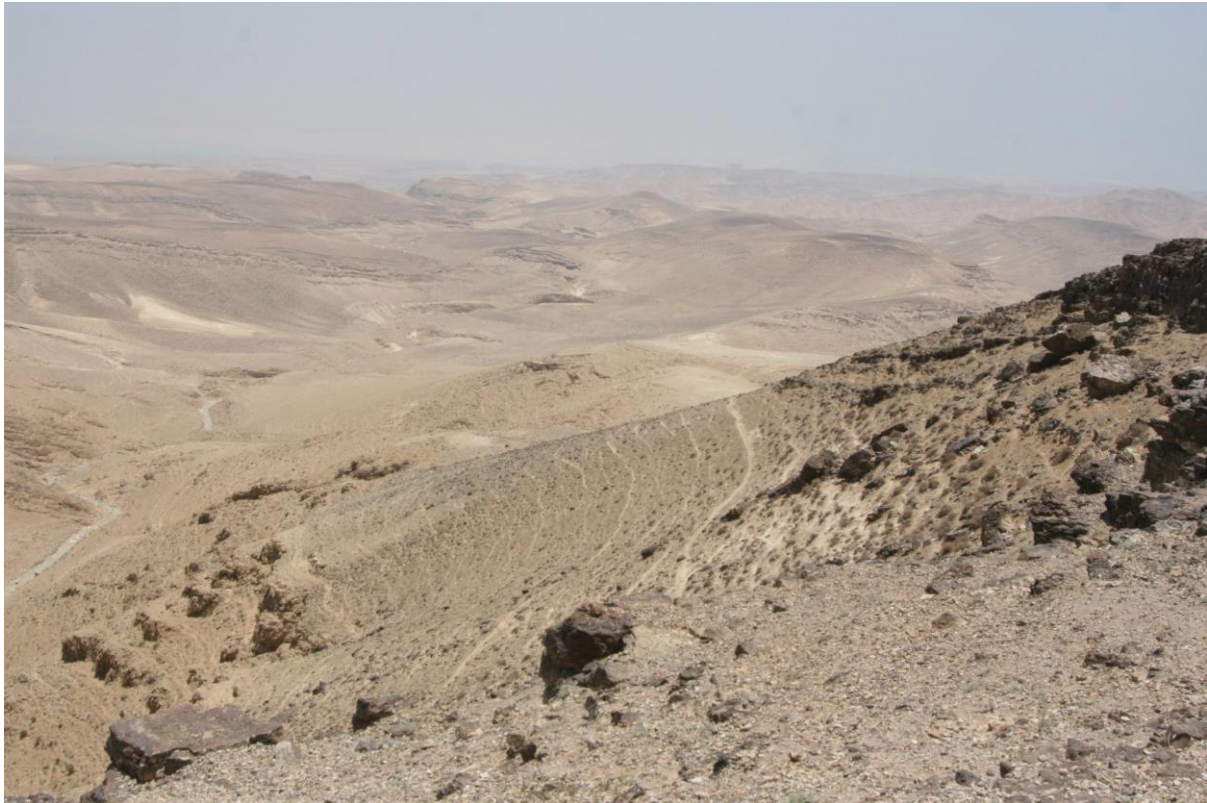
The Judean Wilderness.

Mk 1.6: John is ascetic from the wilderness.