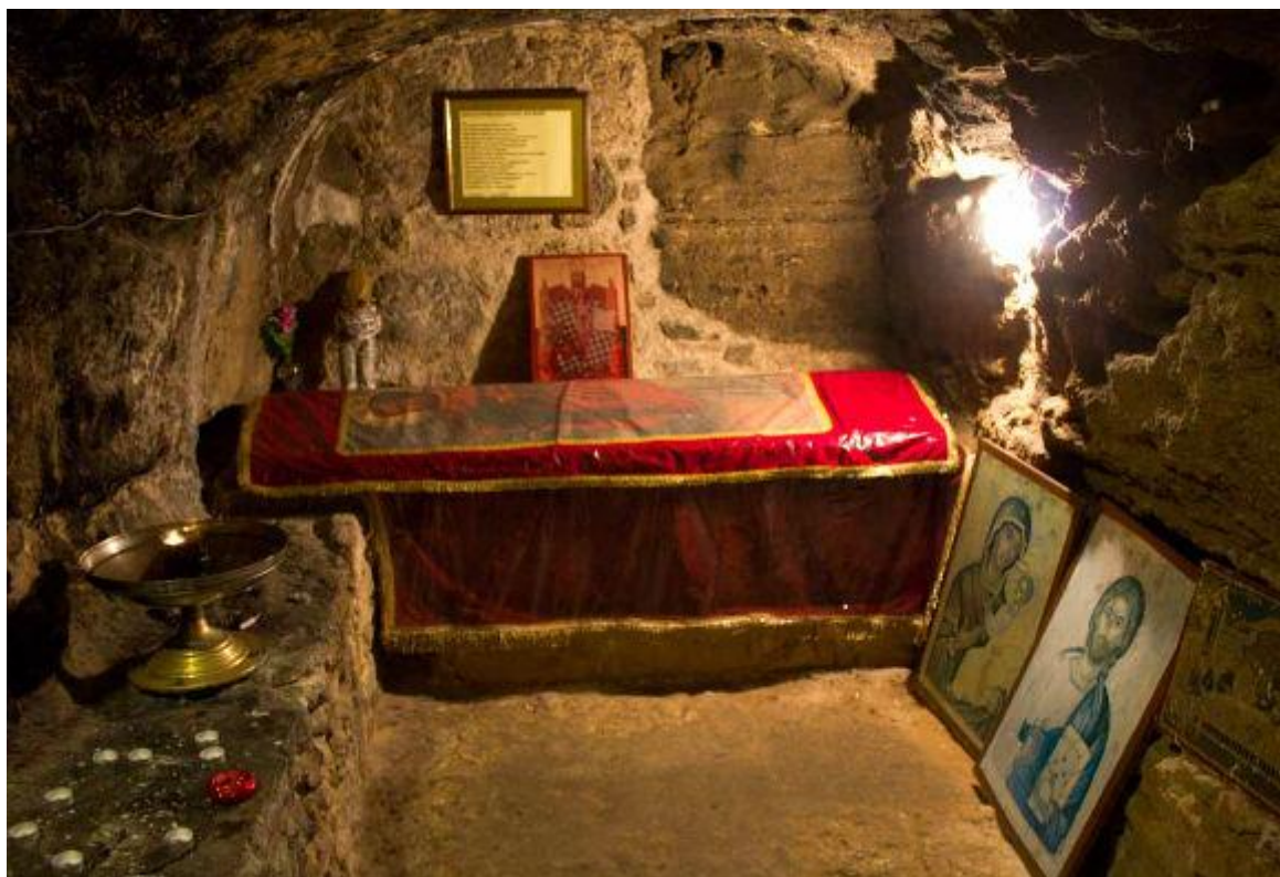
Sarcophagus of St Barnabas, Cyprus