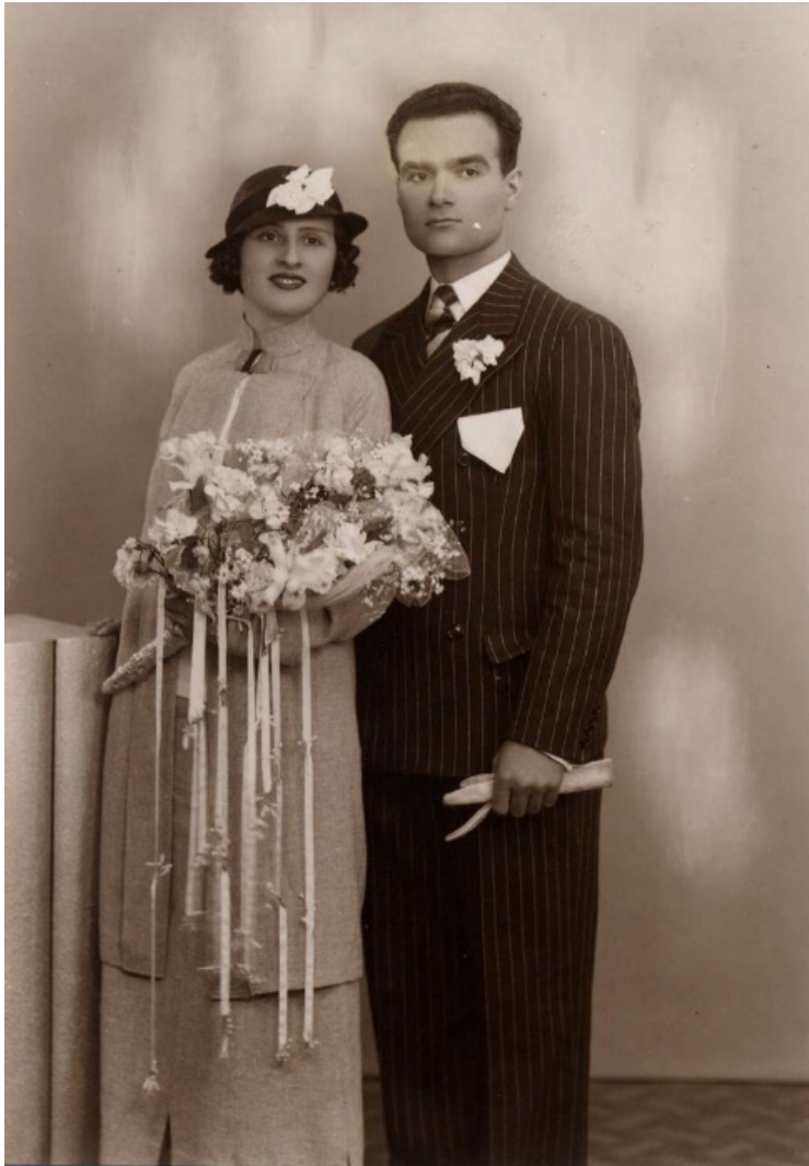
1935 Catholic Wedding in Spain

A good place to begin is this site " catholicweddinghelp ". It covers all the topics that you will reflect upon with your celebrant.